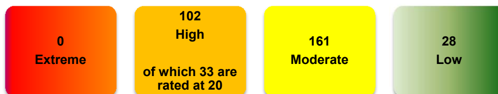
Fig 1: UHL Organisational Risk Register profile by current rating (31/03/21)

3.2 New risks continue to be identified by CMGs and presented to the Executive Board meetings on a weekly basis for review and endorsement ahead of being reported on the organisational risk register. Details of the new risks scoring 15 and above which have been approved during March 2021 are provided for information below: